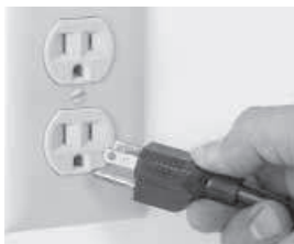
Fig. 6-1 Correct

THIS MACHINE IS PROVIDED WITH A THREE-PRONG GROUNDING PLUG. THE OUTLET TO WHICH THIS PLUG IS CONNECTED MUST BE PROPERLY GROUNDED. IF THE RECEPTACLE IS NOT THE PROPER GROUNDING TYPE, CONTACT AN ELECTRICIAN. DO NOT UNDER ANY CIRCUMSTANCES CUT OR REMOVE THE THIRD GROUND PRONG FROM THE POWER CORD OR USE ANY ADAPTER PLUG (Fig. 6-1 and Fig. 6-2).