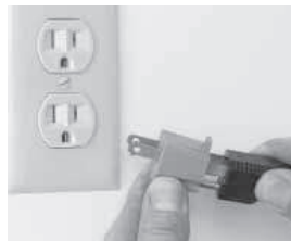
Fig. 6-2 Incorrect